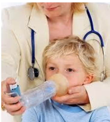
Adult helping child